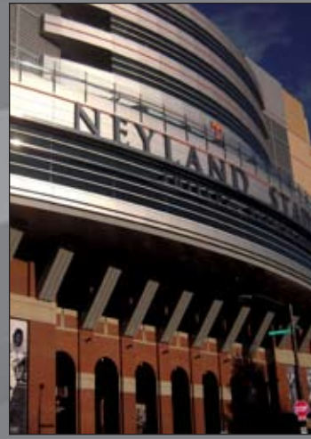
NEYLAND STADIUM, TN