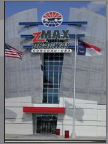
ZMAX DRAGWAY, NC