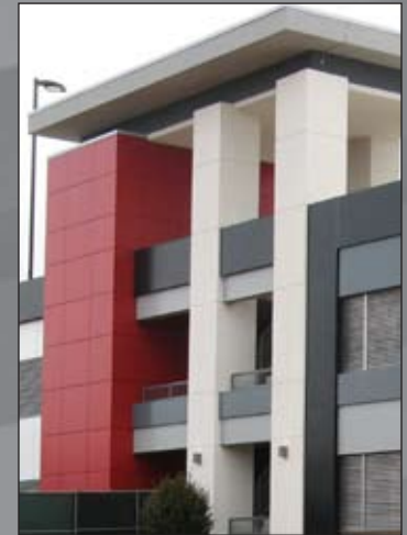
RED VENTURES, SC