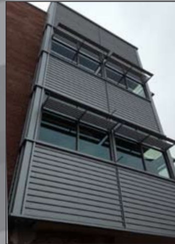
MARIST SCHOOL, GA