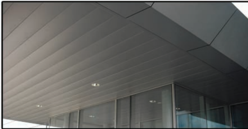
TACG CANOPY; PENDERGRASS, GA