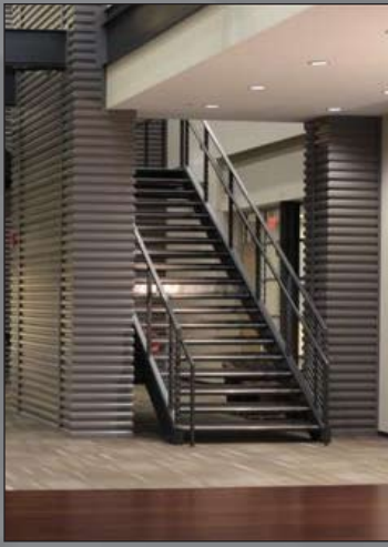
MITSUBISHI ELECTRIC, TN