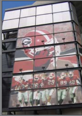
SANFORD STADIUM, GA