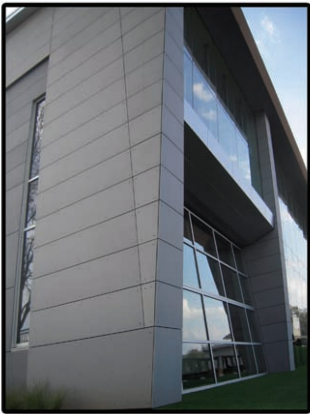
BUTTS-MEHRE EXPANSION UNIVERSITY OF GEORGIA, ATHENS, GA