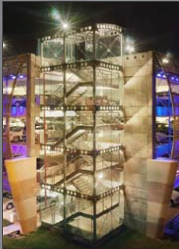
CDIA PARKING DECK, NC