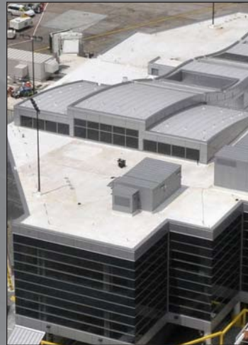
CONCOURSE D, GA